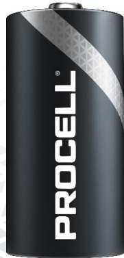
Size: C (LR14) PC1400